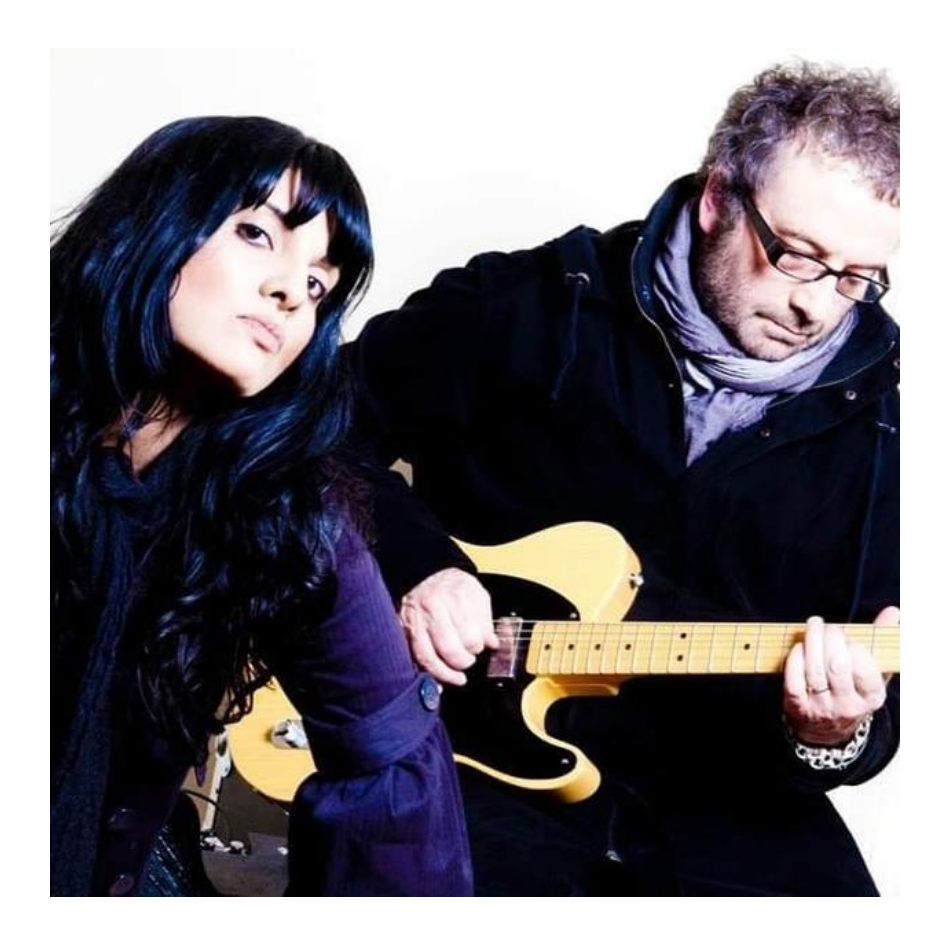
Fri 25th Satsangi Unplugged Gig at the Stables, 8pm (doors 7.30pm).