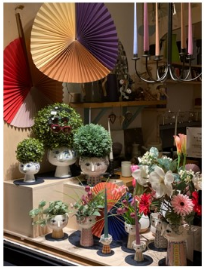
The beautiful new window at Ingrid's House!